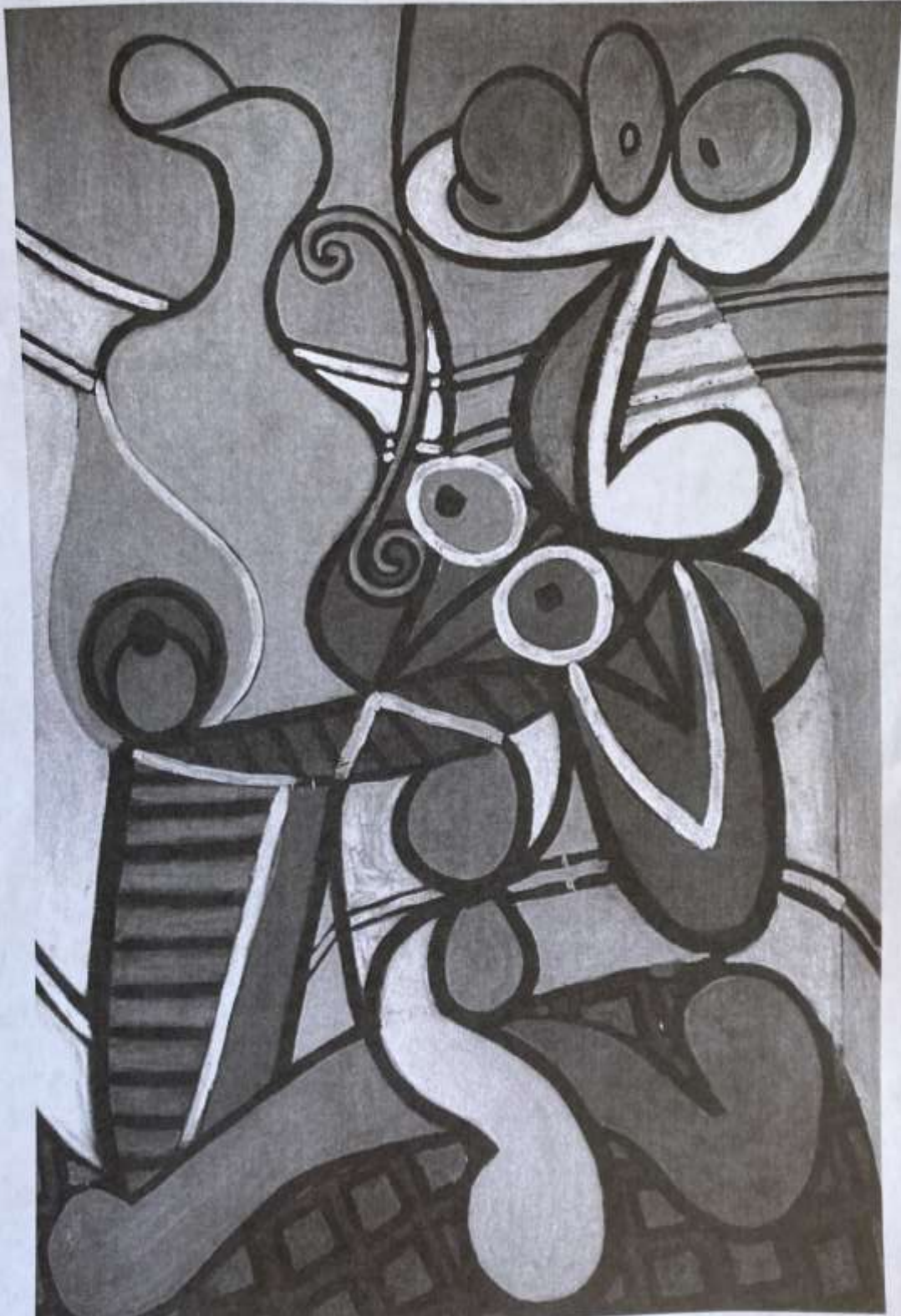
Large Still Life on a Pedestal Table, 1931