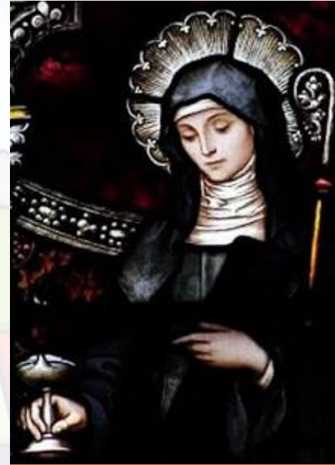
St. Brigid on stained glass in St. Joseph Catholic Church, Georgia.